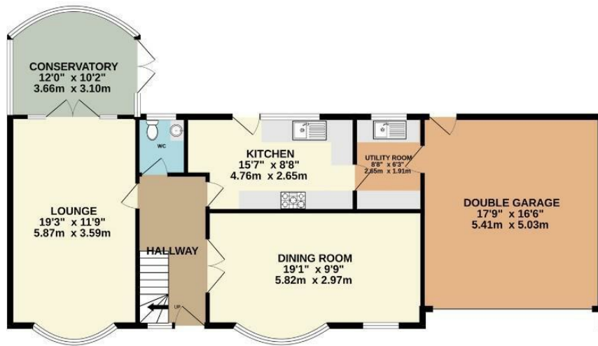
GROUND FLOOR 1151 sq.ft. (106.9 sq.m.) approx.